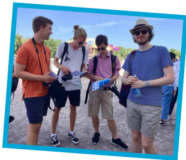
Workshops with professional photographers