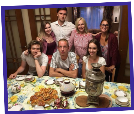
Day at Rotarians families