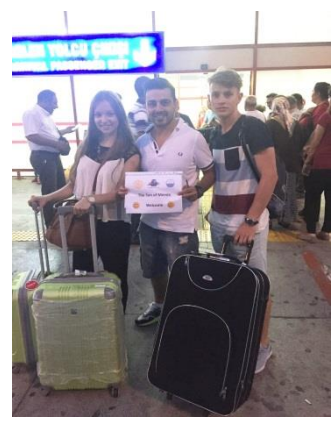
July 7-9 (SUNDAY-Tuesday): ARRIVAL PROGRAMS of HOST FAMILIES (3 Days with Host Families)