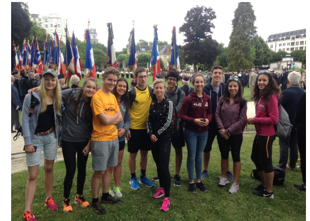
STUDENTS AND BASTILLE DAY IN CAMP 2016