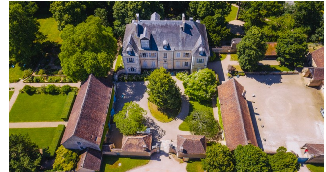
Georges SAND Domaine in NOHANT