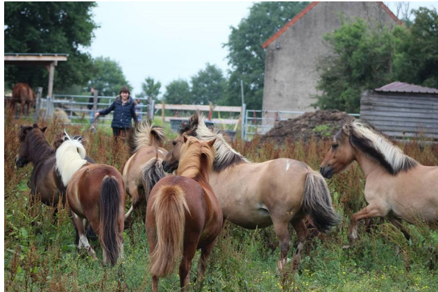
HORSES LIVE ALL YEAR ROUND

You will experience international friendship, practice horseback riding in the middle of the nature. We offer many equestrian activities.