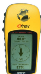
GPS tracking tour