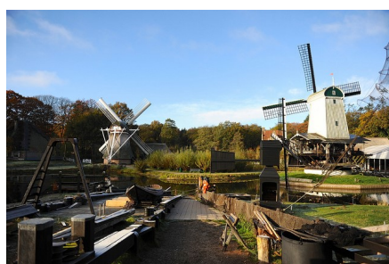
Visiting world famous musea