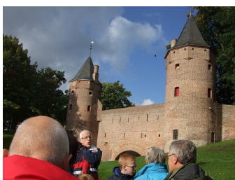
Visiting castles with a bike