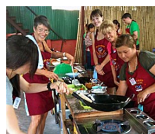
Cooking together traditional meals