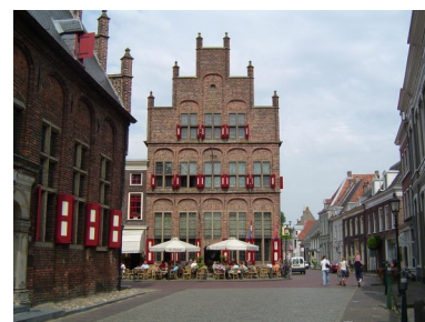
Visiting the oldest pub/bar in Holland